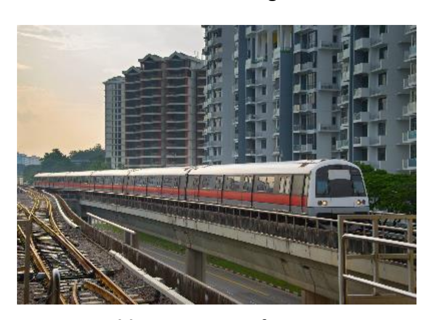
Public Transport Infrastructure