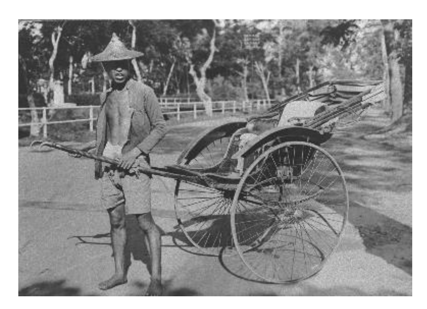
A Chinese rickshaw rider