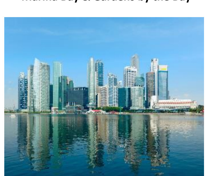
Central Business District