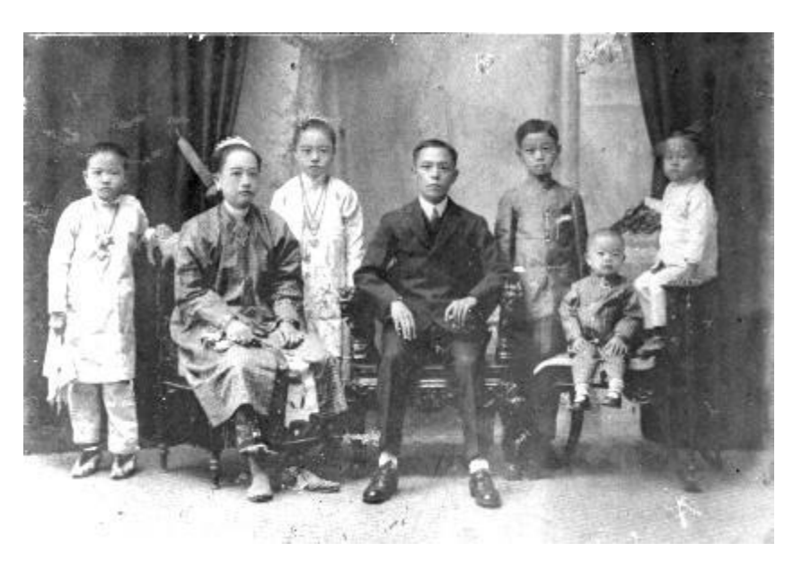
A Peranakan Family