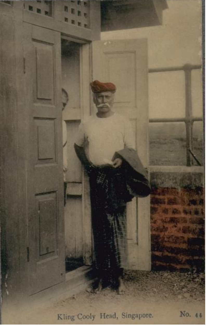
A "kangany" or Indian labour foreman