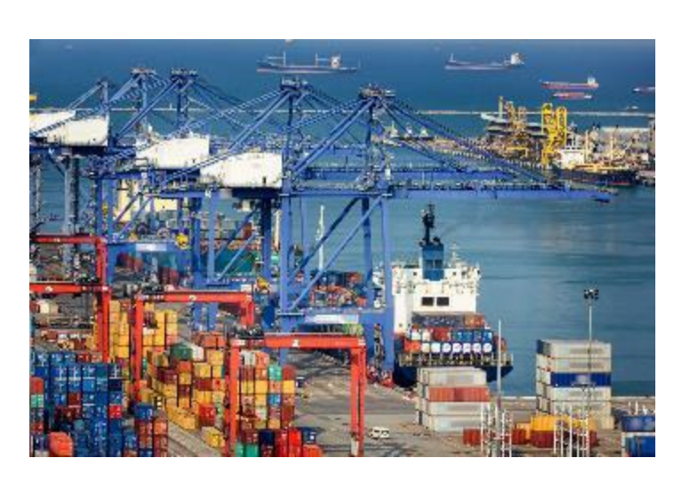
Port of Singapore