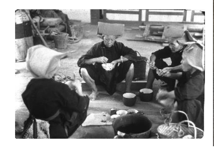
"Samsui" women, or Chinese construction labourers