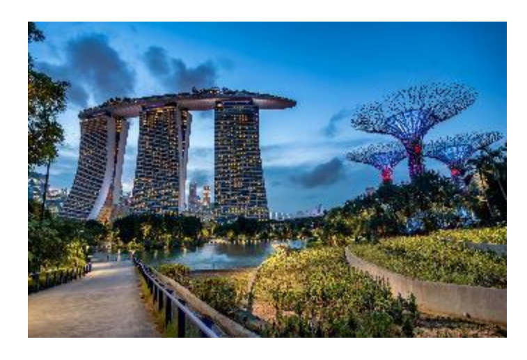
Marina Bay & Gardens by the Bay